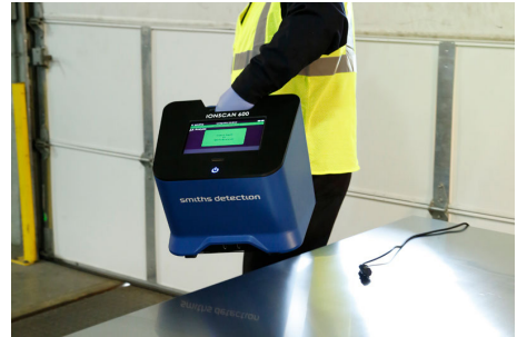
Lightweight and easily portable for dynamic security screening environments. Carry handle available only on non-printer unit.