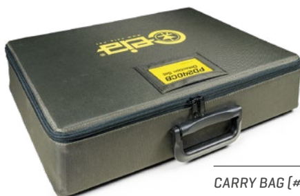
CARRY BAG [# 64082]