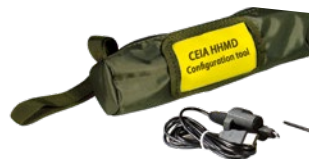
HHMD CONFIGURATION TOOL [# 63537]